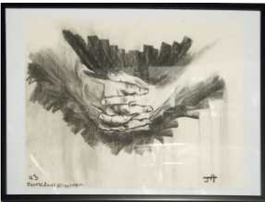
23 Biomedical Engineer