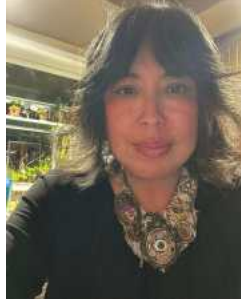
1 - Trophy Wife- Patron Saint of Artsy Moms $80