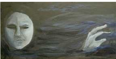
Drawing Close the Night