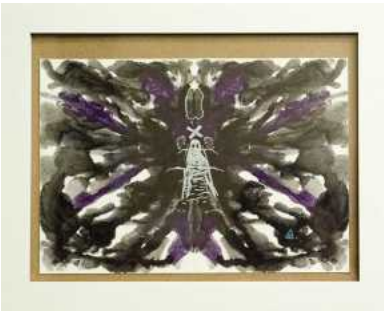
Divine Ruler of Isolation