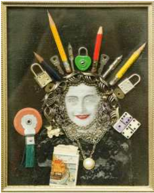
7 - The Student Anne Frank- Patron