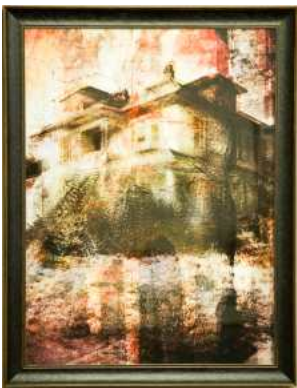
A Ghost of a House Digital collage on German etching paper 2020 $375 framed / $275 unframed