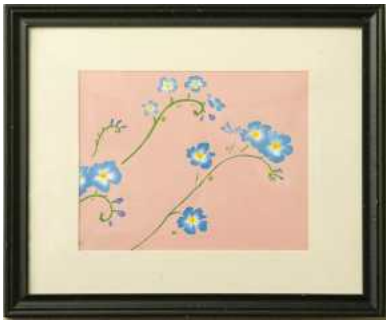
Zhostuou Sumi forget-me-nots